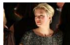
Fashion savvy celebrities assemble at New York Fashion Week.